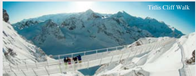
Titlis Cliff Walk

Experience a mind-blowing day in the snow at Mount Titlis at 3,020 meters above sea level. Up at the peak there is only one season: Winter. Enjoy snow in the midst of summer while riding a glacier chairlift, the ice-flyer, over the glacial crevice, visit the glacial caves and cross the