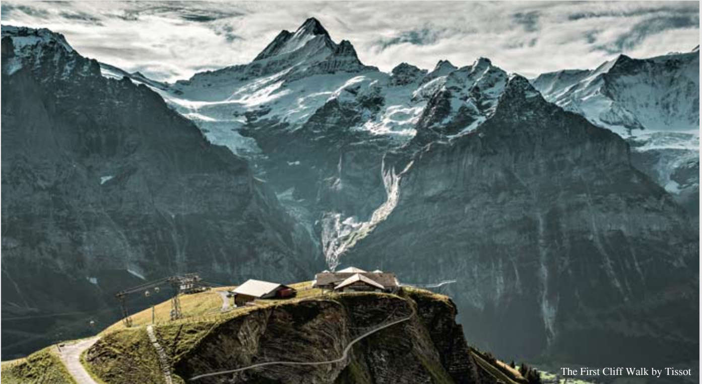
The First Cliff Walk by Tissot

The journey takes you through tunnels built between 1896 and 1912. Two stops in the tunnel permit spectacular views of the Eiger north wall and the surrounding glacier world.