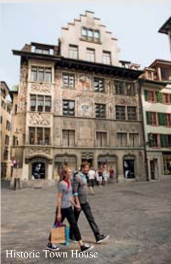
Historic Town House

Lucerne is embedded within an impressive mountainous panorama. Thanks to its attractions, its souvenir and watch shops, the beautiful lakeside setting and the nearby mountain excursion, the town is a must-see destination for many travel groups and individuals on their journey through Switzerland.