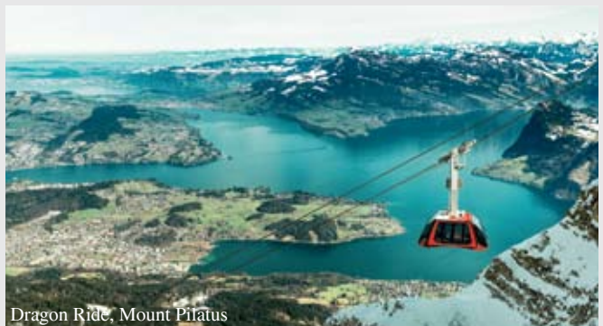
Dragon Ride, Mount Pilatus

The 'Golden Round Trip' starts with a relaxing cruise on