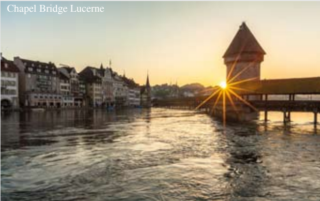
Chapel Bridge Lucerne

Thun on one of the many ships, which even include historic paddle steamers.