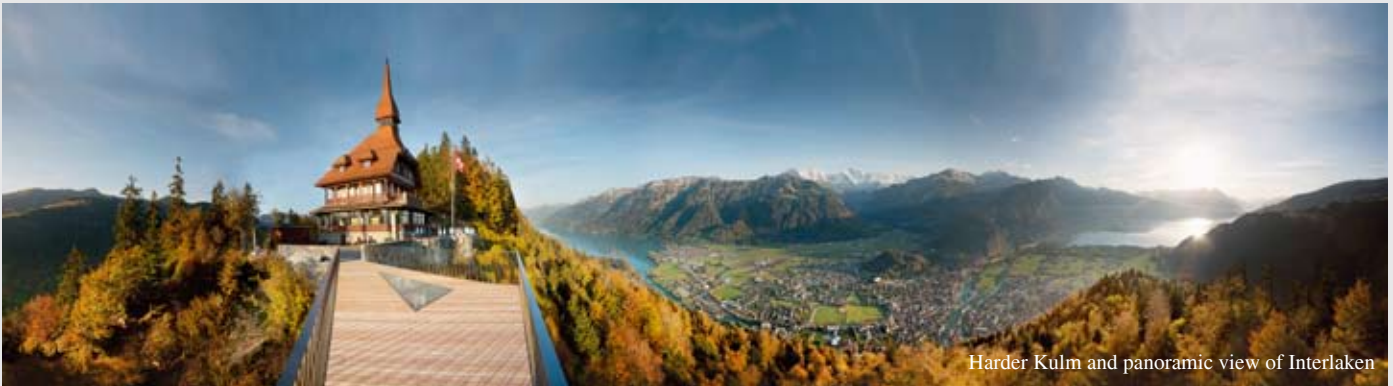
Harder Kulm and panoramic view of Interlaken

can also arrange for a barbecue at the lake.