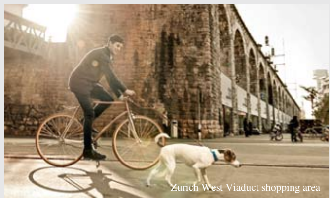
Zurich West Viaduct shopping area